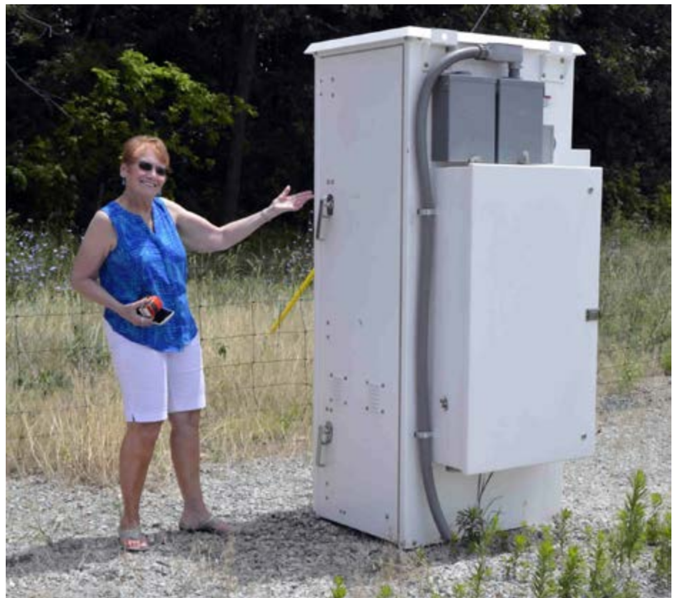
Article and photo provided by Al Burke, WB9SSE.

The enclosure is designed to house telecommunications equipment in harsh environments and as such is ruggedly built and has provisions for integral heating and cooling. It will provide ample room for the new Yaesu Fusion DR1X repeater the club acquired for use on 146.340/.940 that enables both analog-FM as well as C4FM-CDMA digital FM operation.