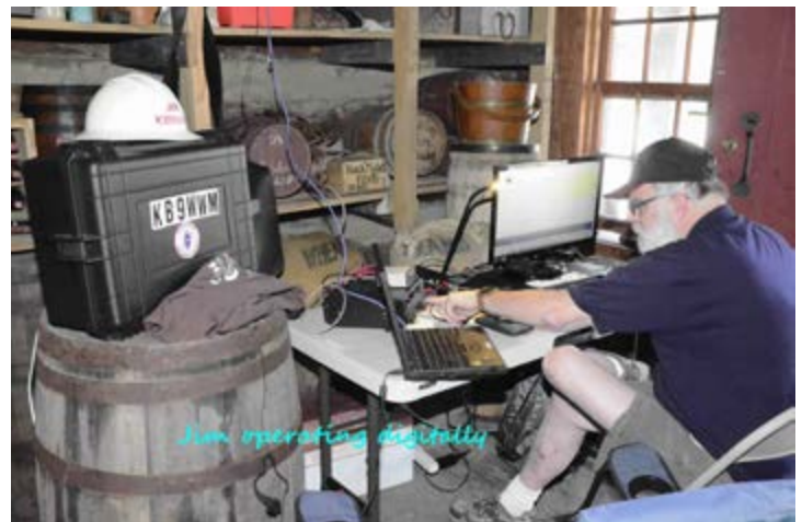
Ham operating digitally