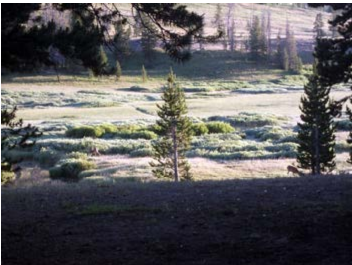
Photo F - Two bucks at Atlantic Creek camp