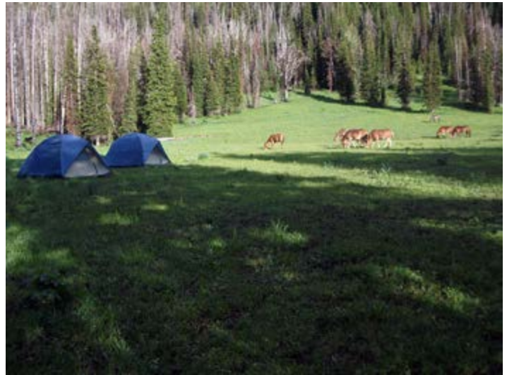
Photo B - Soda Fork camp with horses and mules grazing