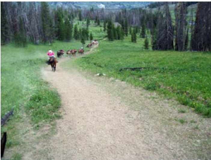
Photo E - On the trail to the Atlantic Creek camp

The Milwaukee store is located at 5710 W Good Hope Rd, Milwaukee, Wisconsin. http://www.hamradio.com/press-release.cfm