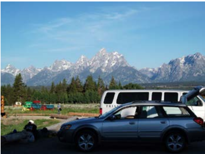
Photo A - At the Ranch with Grand Teton in the background