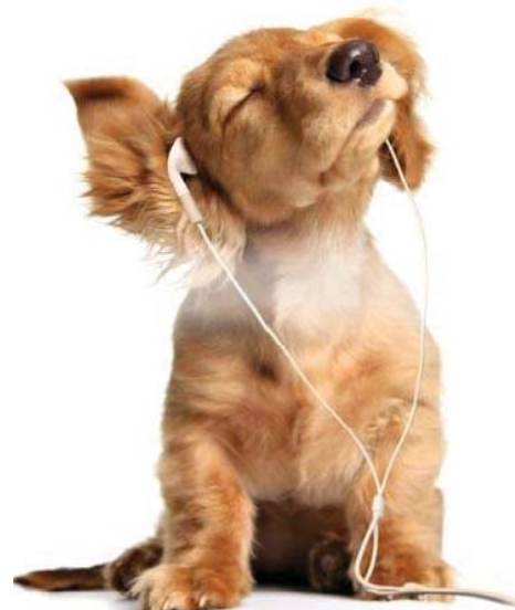
Listening to interval signals brings back fond memories

The fact that these tunes are still running around in my head really says how much of an impact SWLing had on me when I was around twelve years old.