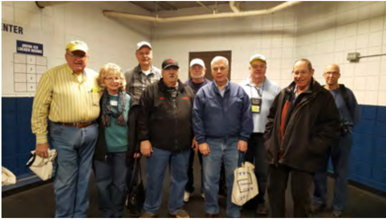
Some of the hams from Fort Wayne and the surrounding area at the Toledo, Ohio Hamfest At Owen College.