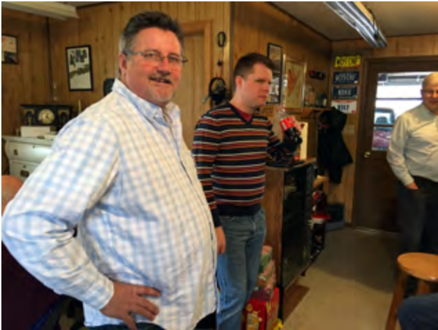
«««««««« Break Time- KD9GDY and W9HT ««««««««