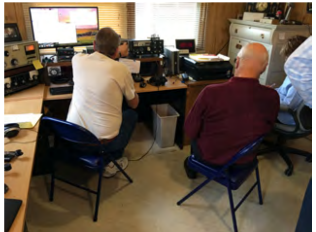
>>>>>>>> The best side of N8KR and K9LI! >>>>>>>>