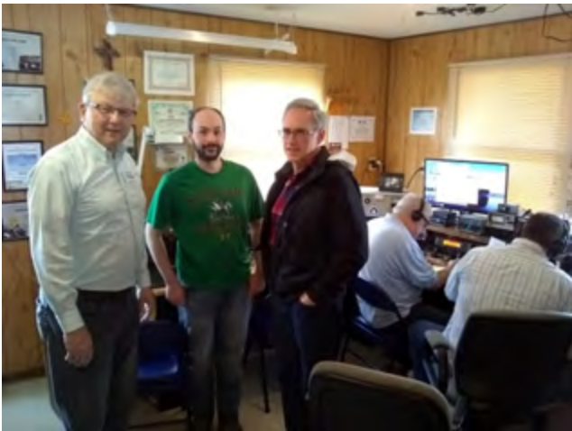
«««««««« WA9BBN, KD9INL, and KD9KSB ««««««««