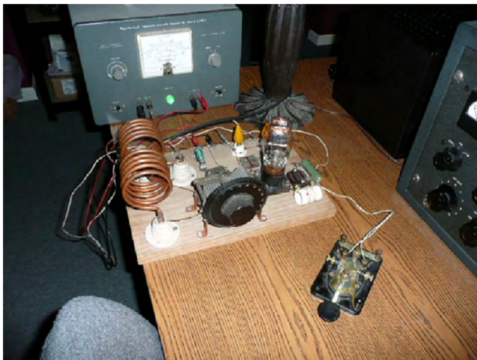
K9VKY's 1929 Transmitter

QOTD AT 5, 8, 12, 15, 20, 25, AND 30 WPM