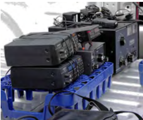
Photos of the FWRC Tailgate Hamfest were provided by Al Burke, WB9SSE.