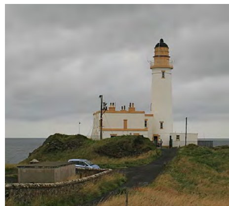
Turnberry Lighthouse ILLW UK0000