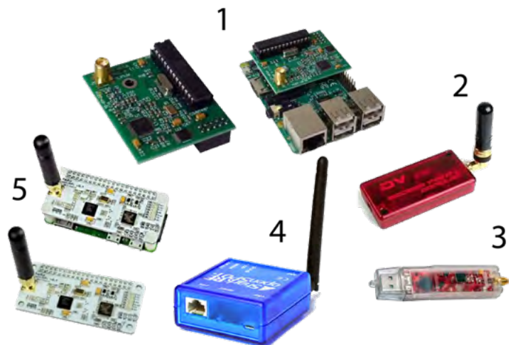
1) DVMega (by itself and mounted on a Raspberry Pi), 2) DVAP, 3) DV4Mini, 4) SharkRF openSPOT, and 5) ZUM Radio ZUMspot (by itself and on a Raspberry Pi Zero)

Photos of the more popular hotspots are in the figure below. The table below it includes tidbits of information I gleaned from the web on each of them. Accuracy is not guaranteed but web links are provided if you want more information. Ken AB9ZD