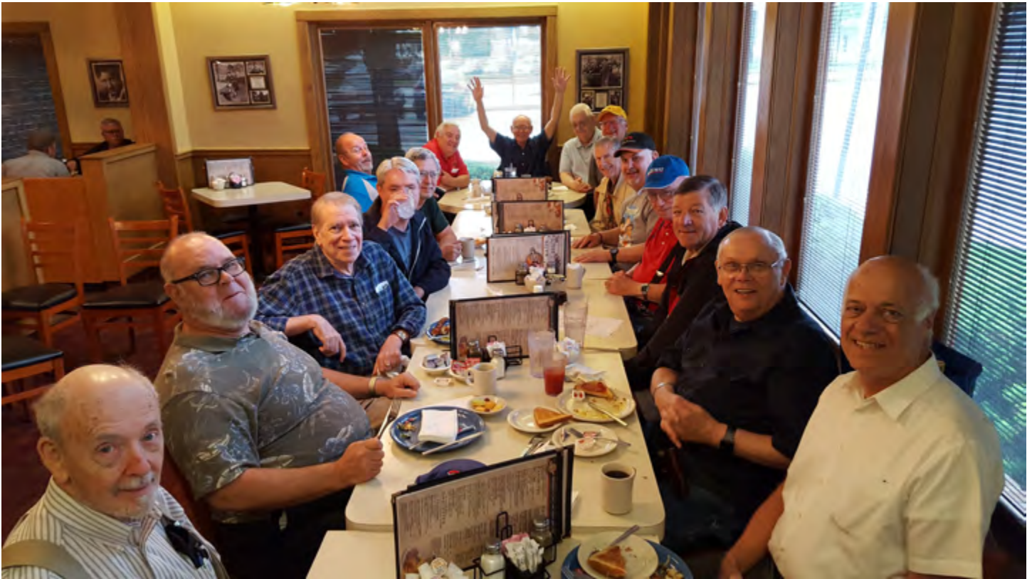
The local hams who get together at 8 AM on Tuesday mornings for breakfast at Halls Hollywood at Lima and Coliseum. This morning, on June 5th, 17 were there for good food and conversation. Anyone is welcome to join them.