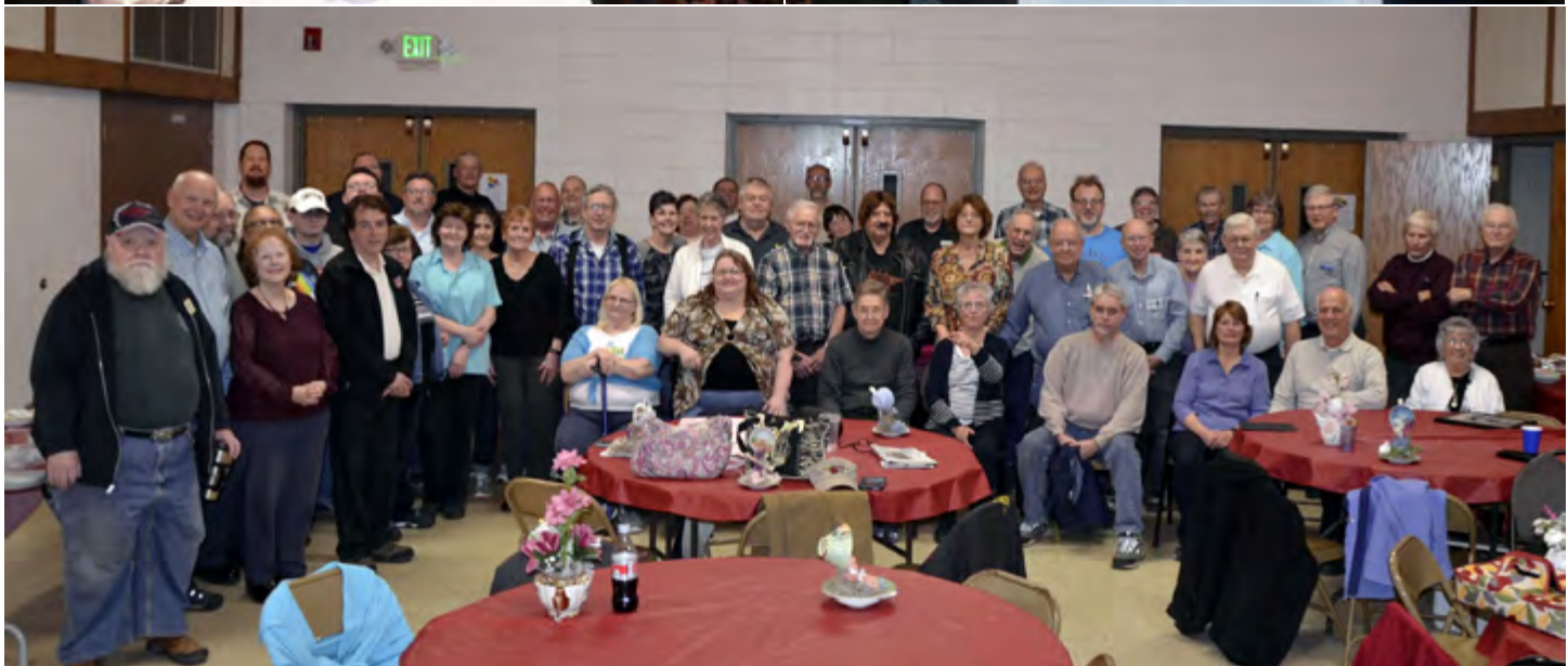
More photos on pages 3, 5, 9 and on the FWRC web page.