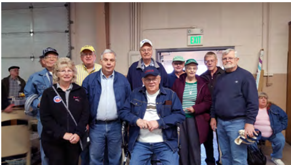
Photo of the Fort Wayne hams at the Peru hamfest on Saturday 4/28/2018.

http://www.arrl.org/news/arrl-suspends-registration-for-emergency-communications-course-as-online-platform-announces-shutdown