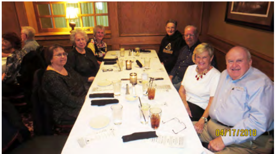
ACARTS banquet