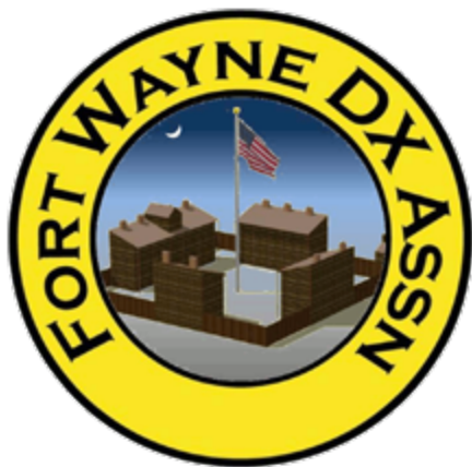
Carl Luetzelschwab, K9LA

Last month's column showed the recent increase in FT8 activity and determined the advantage of FT8 over CW. Although a nominal 7 dB advantage was cited, it was acknowledged that this could easily vary either way by several dB or more depending on your ability to copy weak-signal CW and the fact that real-world decodes of FT8 can be better than what's in the documentation.