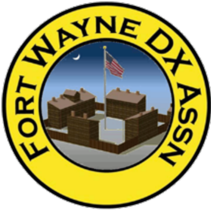
Carl Luetzelschwab, K9LA

The upcoming DXpedition to 3YØZ Bouvet in early 2018 is an important one to get worked and confirmed since it's currently #2 on the DXCC Most Wanted List at ClubLog: