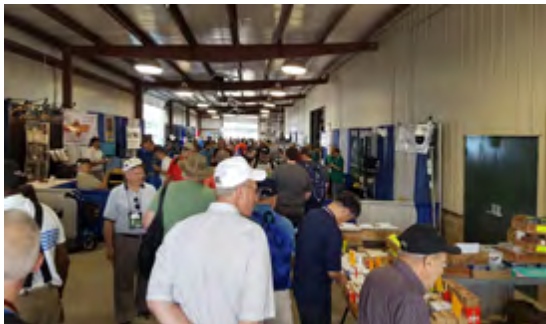
The weather and traffic weren't the best but those who made it there had a good time.