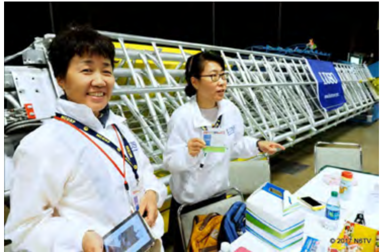
The Big LUSO Tower

sity, DX presentations, technical presentations and vendor displays. I wandered through the vendor area, and drooled over the LUSO Tower display – they had their 4-section, 118-foot tower on display (it was nested, of course). That thing is huge (see photo), and has been on display at Dayton, too.