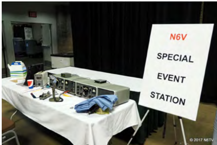
N6V Special Event Station