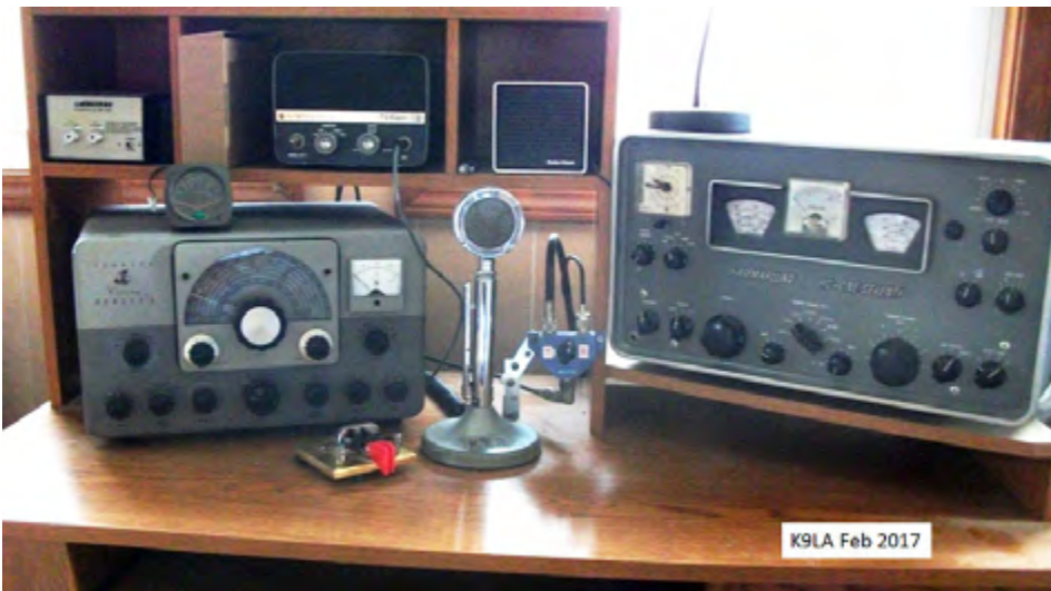
Ranger II and Hammarlund HQ-170

To make matters worse, I also have my National NC-60B receiver from my Novice days. It now works great, and it will be paired with a Viking Challenger transmitter, which is third in line for restoration. Where is this last combination going to go? Space certainly is a problem, but I'm having fun working on and using these old rigs. That's what counts.