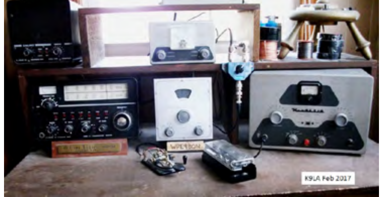
Heathkit DX-35 and Drake 2B

The Globe Chief will get the same loving restoration care as all the other rigs.